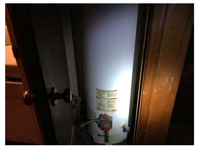
8/23/2019 11:08:37 AM