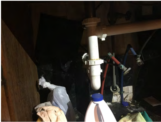
7/24/2019 11:11:57 AM

Project Number: CD-13376 Address: 2312 ORANGE STREET Inspection Date: 7/24/2019