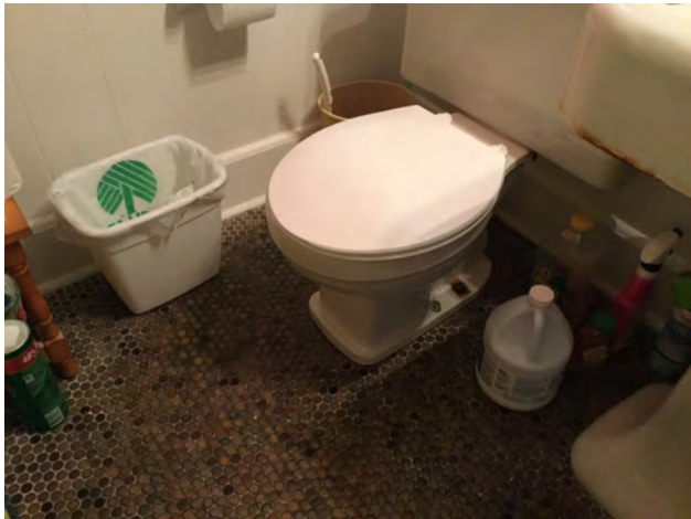
8/22/2019 4:14:44 PM

Project Number: CD-13419 Address: 2306 ALBERT STREET Inspection Date: 8/22/2019