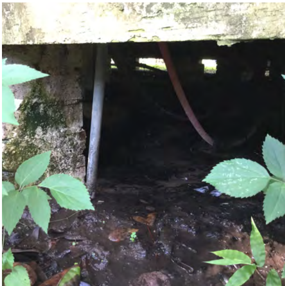
7/24/2019 11:18:06 AM