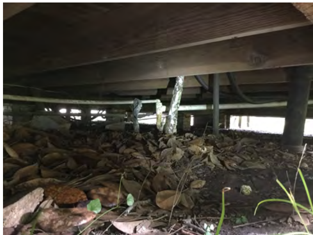
7/24/2019 11:11:57 AM