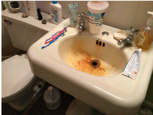
8/22/2019 4:14:43 PM