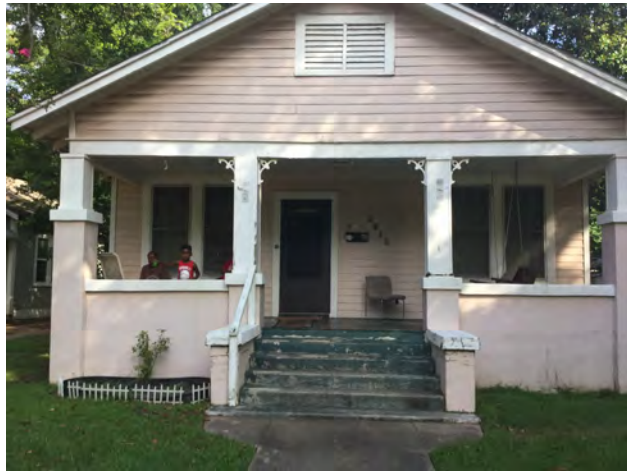
7/24/2019 11:11:56 AM