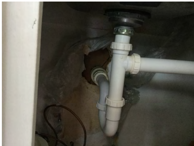
8/22/2019 4:14:45 PM