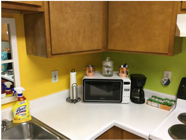
8/28/2019 11:10:54 AM

Project Number: CD-13395 Address: 5617 STEWART CIRCLE Inspection Date: 7/23/2019