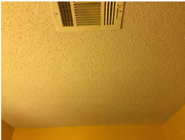
8/28/2019 11:10:56 AM