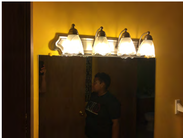
8/28/2019 11:10:55 AM