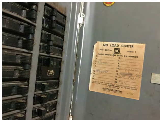
8/19/2019 1:24:10 PM

Project Number: CD-13422 Address: 5108 BLANCHE DRIVE Inspection Date: 8/19/2019