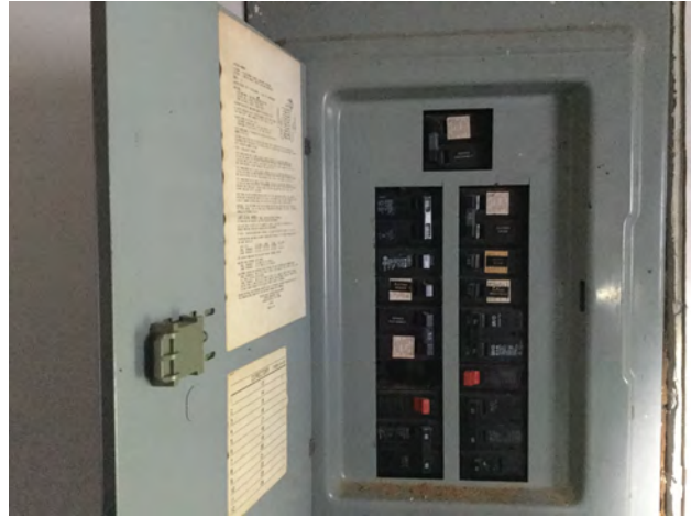
8/5/2019 11:34:14 AM