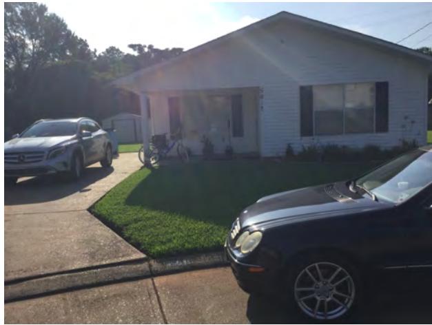
7/23/2019 10:23:41 AM