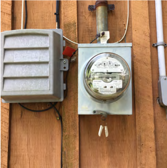
8/5/2019 11:34:16 AM

Project Number: CD-13403 Address: 2908 LOS ANGELES STREET Inspection Date: 8/5/2019