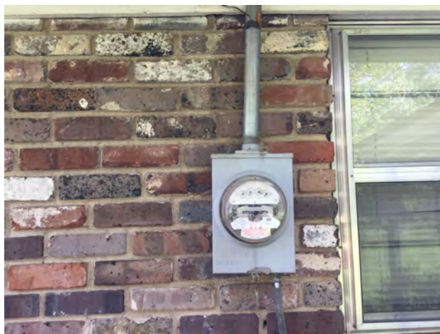
8/19/2019 1:24:11 PM