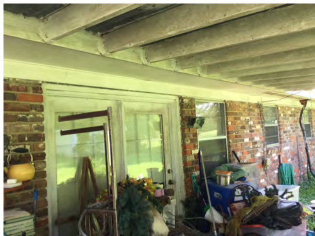
8/19/2019 1:24:12 PM