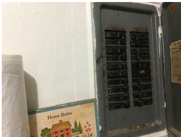
8/19/2019 1:24:09 PM