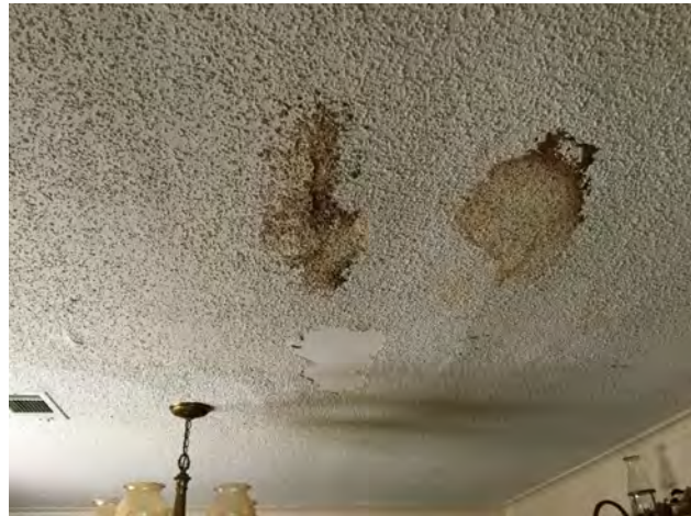
8/19/2019 11:24:02 AM