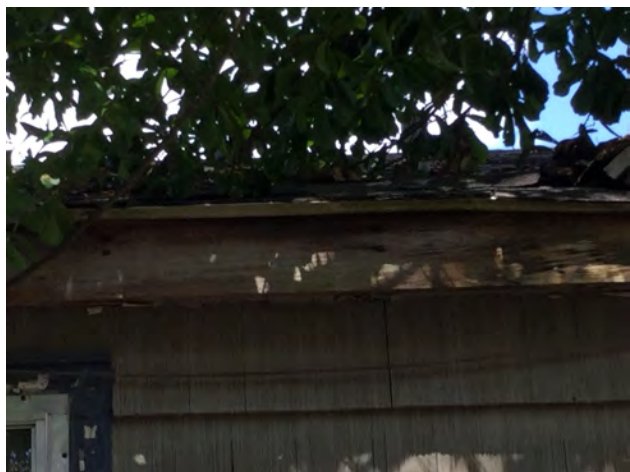
8/14/2019 4:18:42 PM

Project Number: CD-13412 Address: 70 EASTWOOD BOULEVARD Inspection Date: 8/14/2019