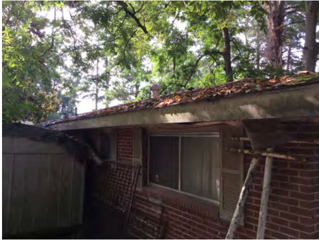
8/13/2019 8:07:22 AM

Project Number: CD-13238 Address: 5520 JUBE STREET Inspection Date: 8/13/2019