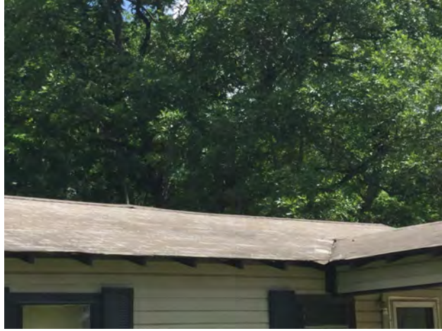
6/7/2019 12:47:29 PM