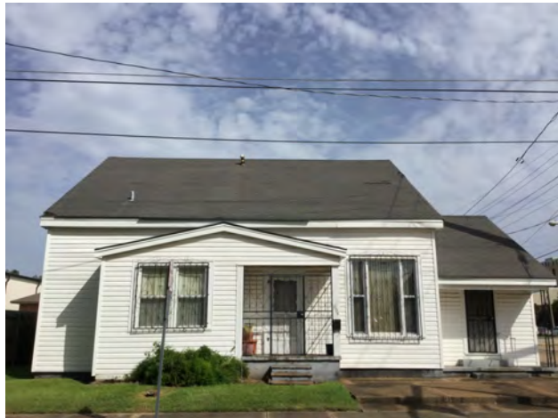
6/27/2019 12:15:51 PM