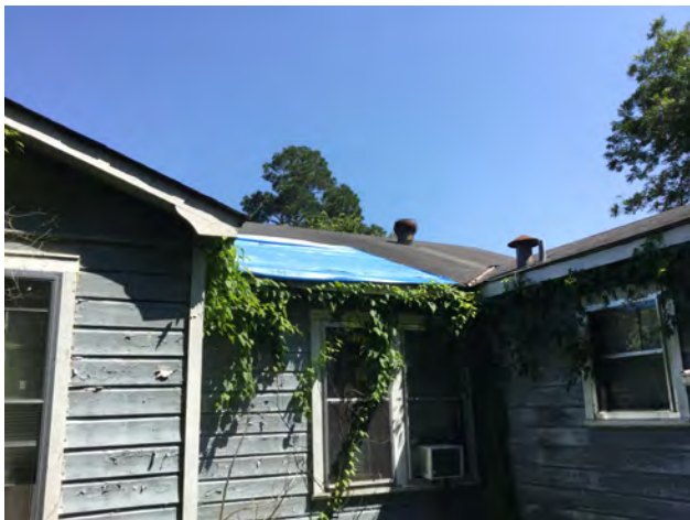
7/30/2019 12:55:54 PM