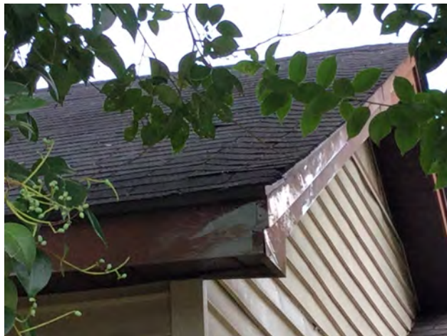
8/19/2019 4:27:49 PM