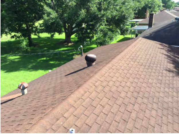
6/12/2019 10:39:19 AM

Project Number: CD-13357 Address: 5964 DEERFIELD DRIVE Inspection Date: 6/12/2019