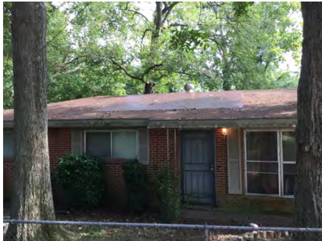
8/13/2019 8:07:24 AM