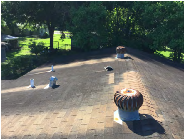
5/28/2019 8:23:42 AM