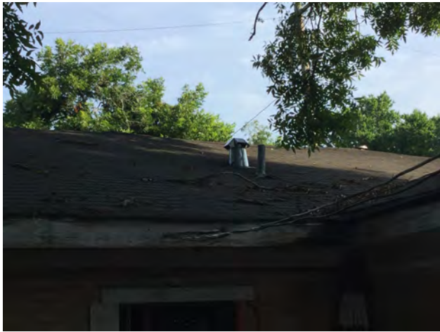
7/16/2019 9:40:19 AM

Project Number: CD-13378 Address: 423 DASPIT STREET Inspection Date: 7/16/2019