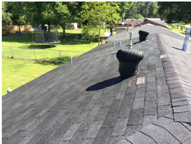
4/12/2018 12:50:13 PM