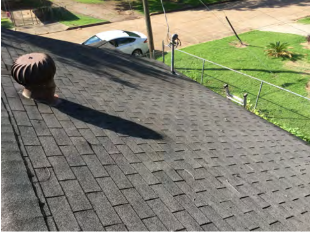
8/10/2018 12:39:03 PM

Project Number: CD-13167 Address: 732 DOUGLAS STREET Inspection Date: 6/6/2018