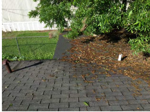
8/10/2018 12:39:02 PM