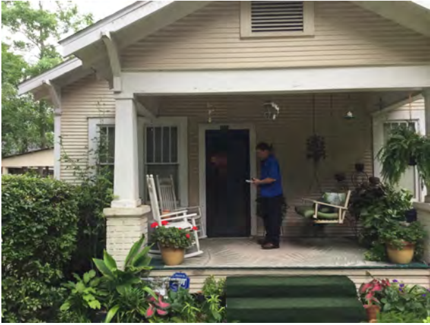
6/26/2019 1:20:37 PM

Project Number: CD-13368 Address: 2244 NOBLE STREET Inspection Date: 6/26/2019