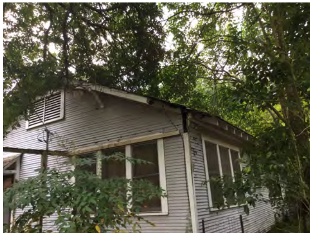
8/5/2019 11:03:35 AM