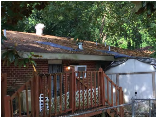
8/13/2019 8:07:25 AM