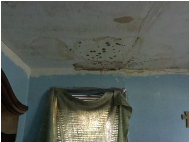
7/30/2019 12:55:52 PM

Project Number: 11622 Address: 2111 ALMA STREET Inspection Date: 7/30/2019