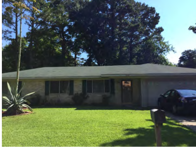
7/6/2018 1:03:22 PM