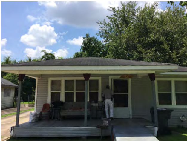
8/19/2019 11:24:09 AM