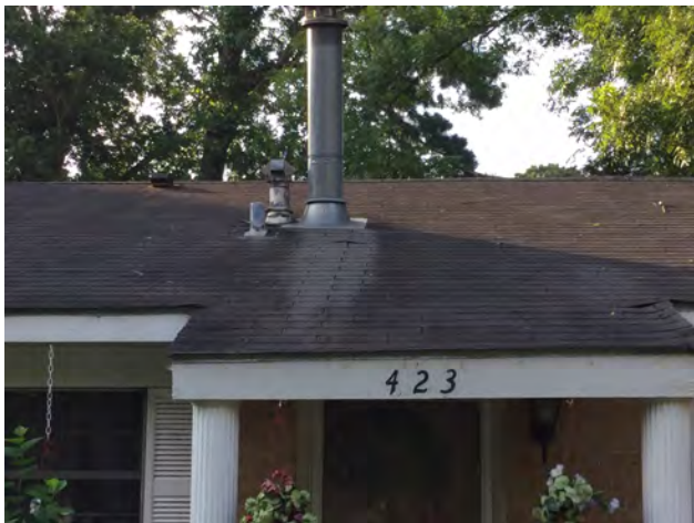
7/16/2019 9:40:21 AM