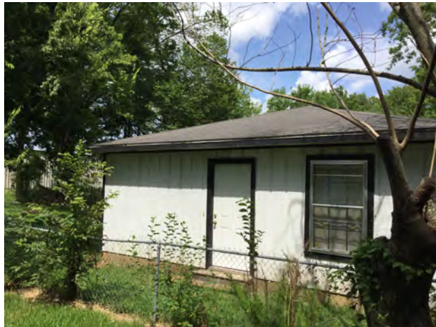
8/28/2019 10:49:10 AM