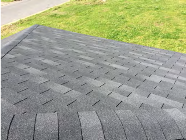
4/12/2018 12:50:12 PM

Project Number: CD-13129 Address: 422 GREENFIELD DRIVE Inspection Date: 4/12/2018