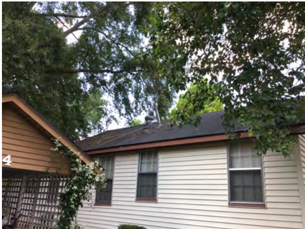
8/19/2019 4:27:48 PM

Project Number: CD-13353 Address: 2322 OLIVE STREET Inspection Date: 8/19/2019