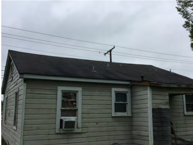
7/23/2019 3:26:44 PM

Project Number: CD-13141 Address: 2504 CULPEPPER ROAD Inspection Date: 5/30/2018