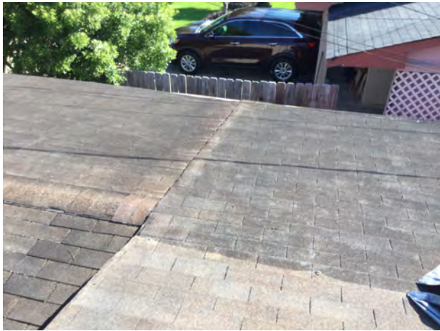
5/28/2019 8:23:35 AM

Project Number: CD-13335 Address: 604 ANN STREET Inspection Date: 5/28/2019