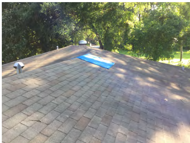
8/13/2019 8:22:54 AM