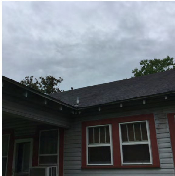
6/26/2019 12:07:47 PM