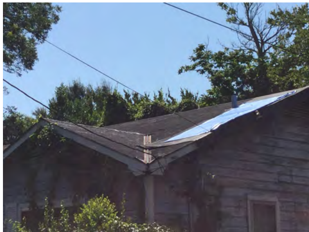
7/30/2019 12:55:53 PM