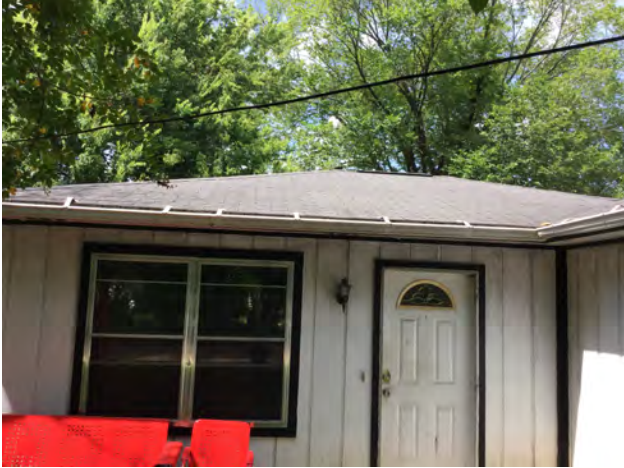
8/28/2019 10:49:09 AM

Project Number: CD-13413 Address: 3021 OLCUTT STREET Inspection Date: 8/13/2019