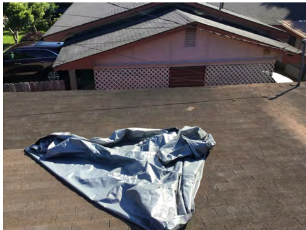
5/28/2019 8:23:41 AM