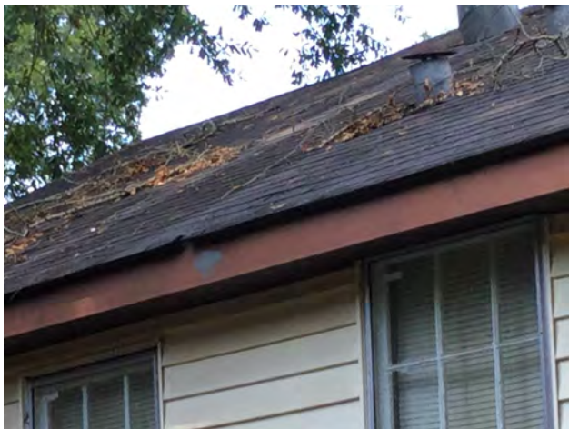
8/19/2019 4:27:50 PM