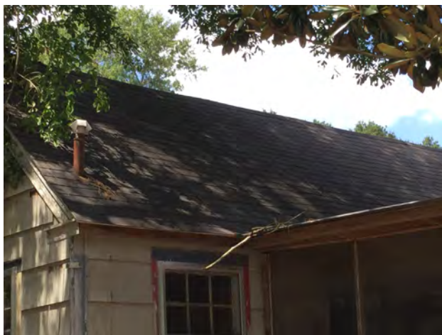
8/14/2019 4:18:42 PM