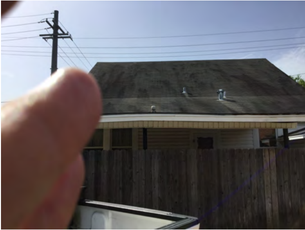
6/27/2019 12:15:50 PM

Project Number: CD-13374 Address: 604 ELLIOTT STREET Inspection Date: 6/27/2019