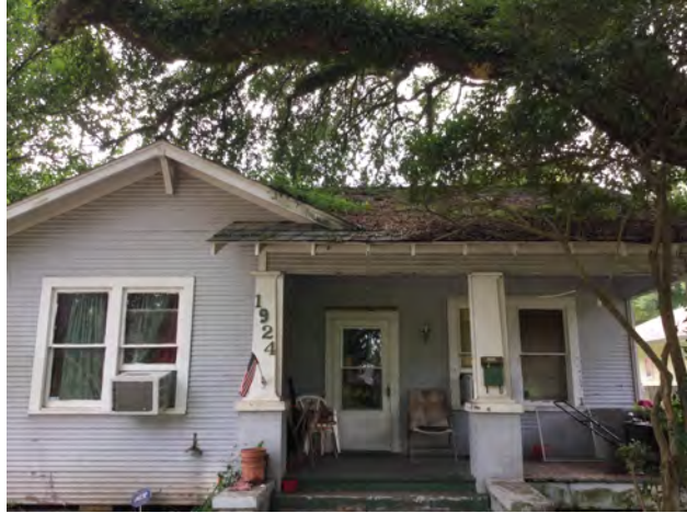
8/5/2019 11:03:32 AM