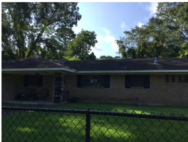
8/13/2019 8:22:50 AM