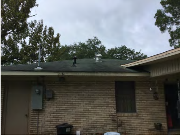
7/23/2019 4:15:14 PM

Project Number: CD-13184 Address: 5107 DONALD DRIVE Inspection Date: 7/6/2018