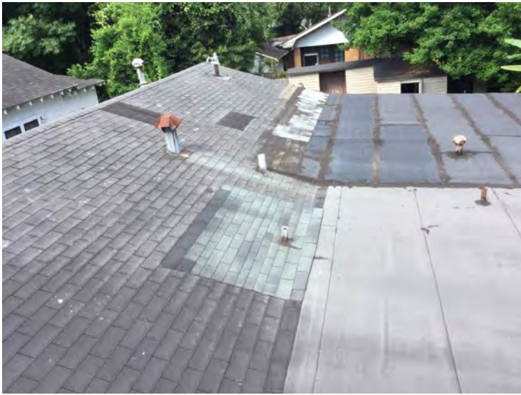
7/2/2019 3:30:04 PM

Project Number: CD-13379 Address: 34 CHESTER STREET Inspection Date: 7/2/2019