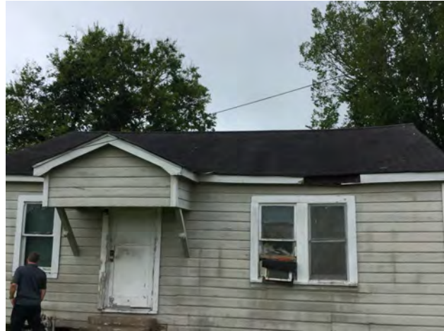
7/23/2019 3:26:43 PM