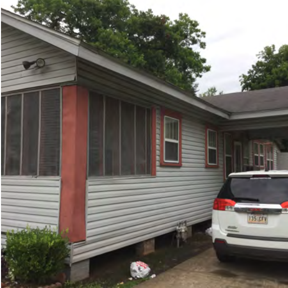
6/26/2019 12:07:11 PM

Project Number: CD-13372 Address: 2024 MADELINE STREET Inspection Date: 6/26/2019