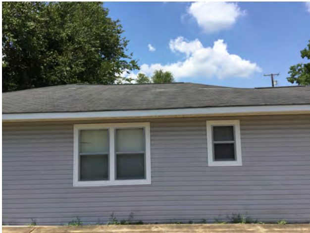
8/19/2019 11:24:04 AM

Project Number: CD-13421 Address: 2638 8TH STREET Inspection Date: 8/19/2019