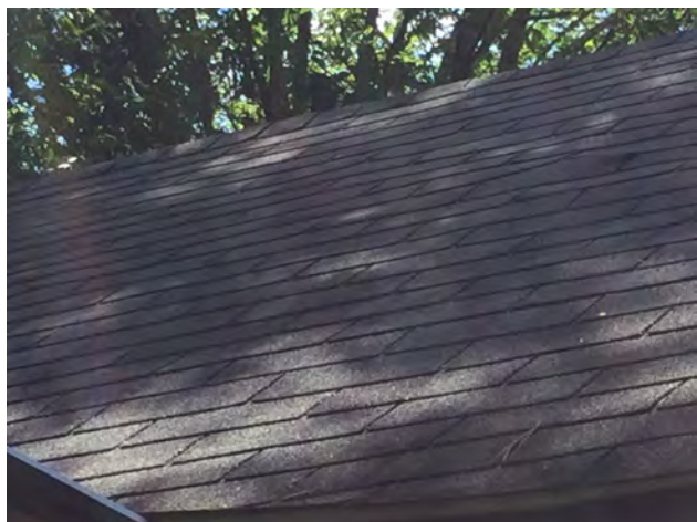
8/14/2019 4:18:43 PM