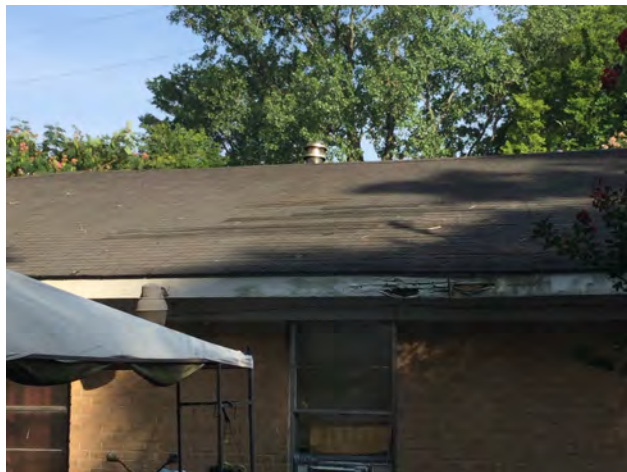
7/16/2019 9:40:20 AM