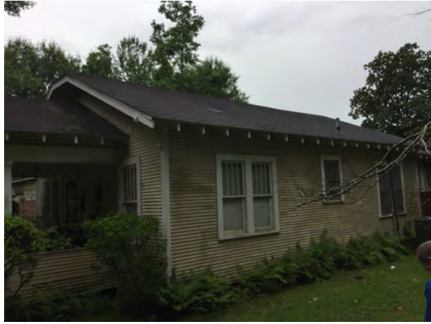
6/26/2019 1:20:37 PM