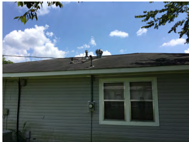
8/19/2019 11:24:08 AM