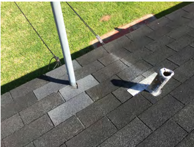
4/12/2018 12:50:17 PM