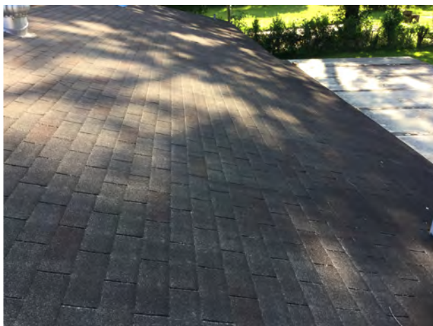
8/13/2019 8:22:52 AM