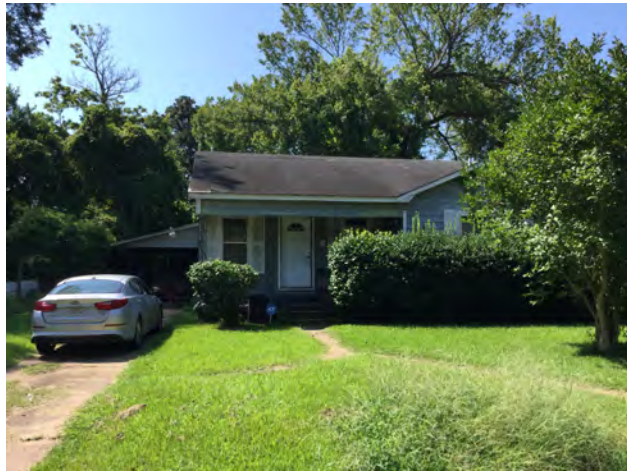
7/30/2019 12:55:51 PM