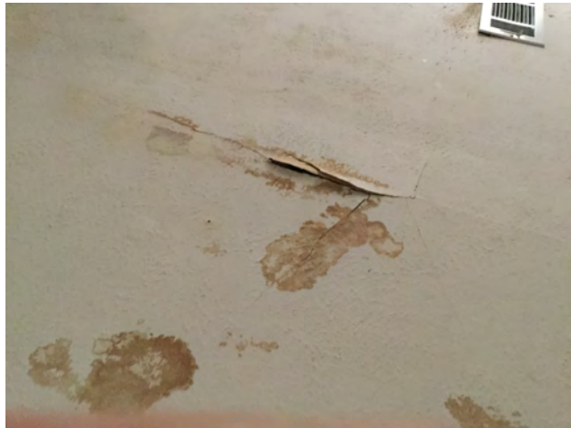
8/19/2019 4:27:43 PM