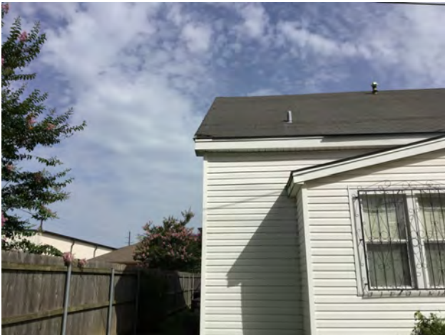
6/27/2019 12:15:51 PM