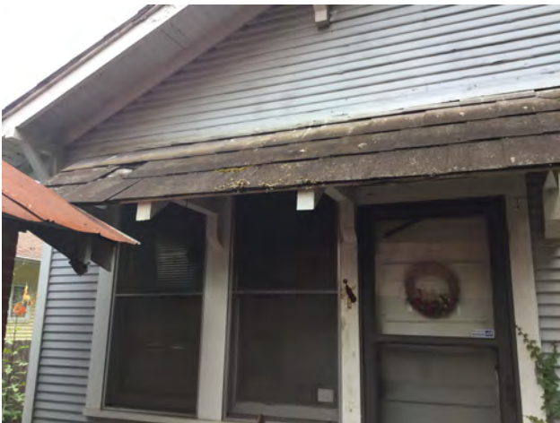
8/5/2019 11:03:36 AM