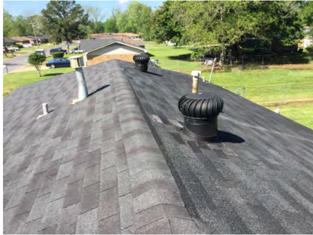
4/12/2018 12:50:10 PM