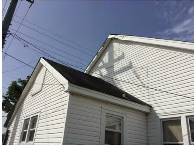
6/27/2019 12:13:46 PM