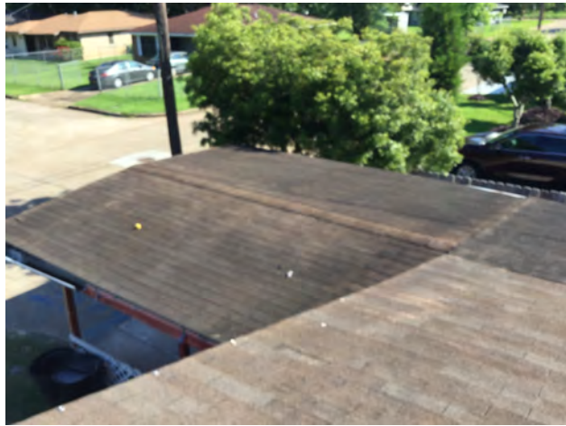
5/28/2019 8:23:20 AM