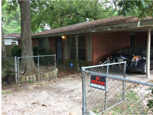
8/13/2019 8:07:18 AM