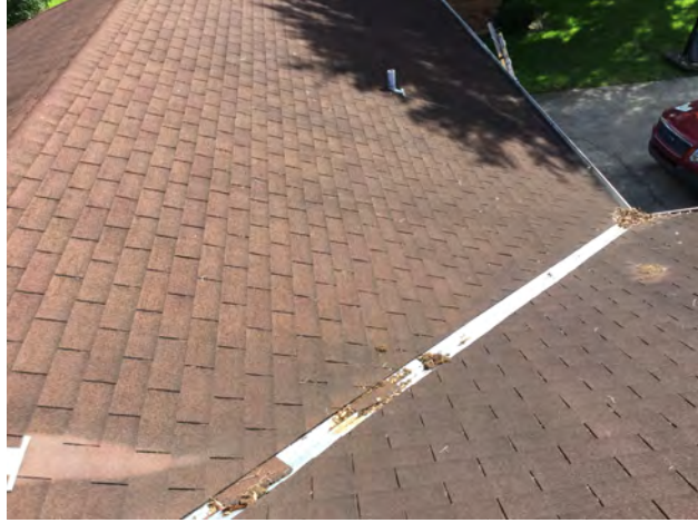
6/12/2019 10:39:18 AM