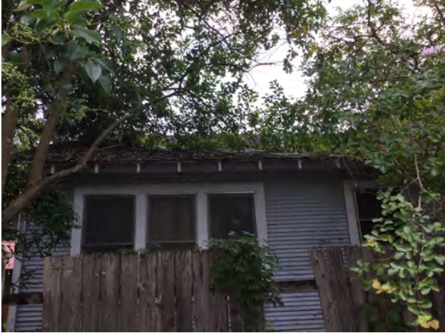
8/5/2019 11:03:34 AM

Project Number: CD-13396 Address: 1924 MADELINE STREET Inspection Date: 8/5/2019