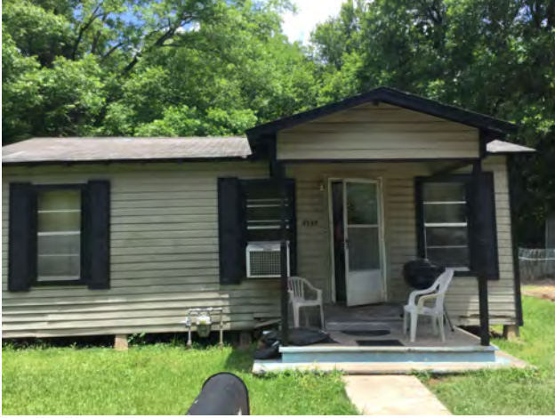
6/7/2019 12:47:30 PM

Project Number: CD-13358 Address: 3735 HENRY STREET Inspection Date: 6/7/2019