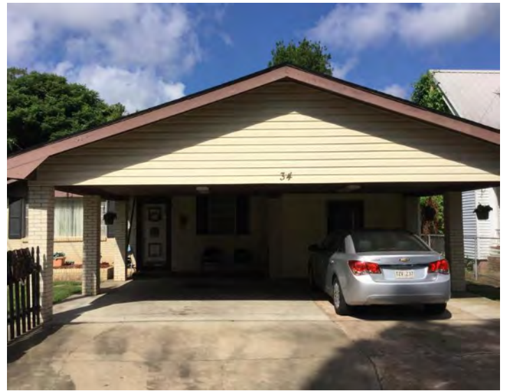
7/2/2019 3:30:03 PM