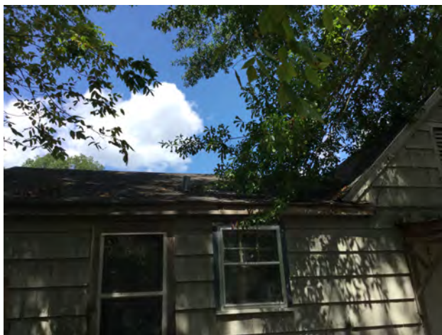
8/14/2019 4:18:41 PM