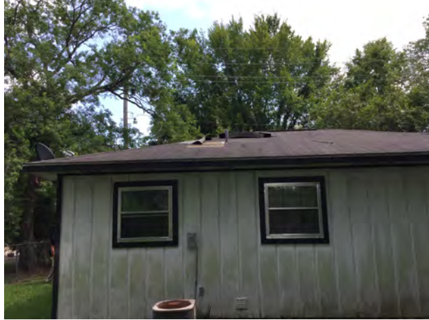
8/28/2019 10:49:07 AM