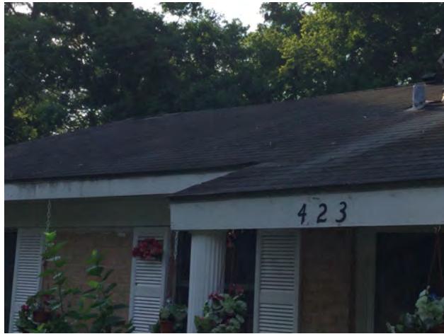
7/16/2019 9:40:18 AM