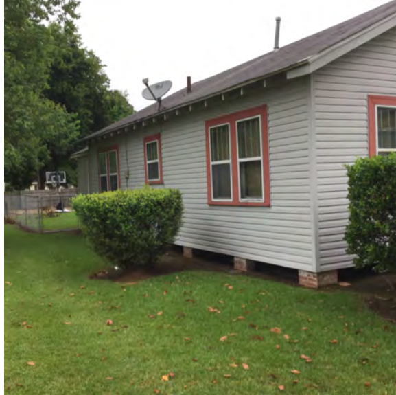
6/26/2019 12:07:11 PM