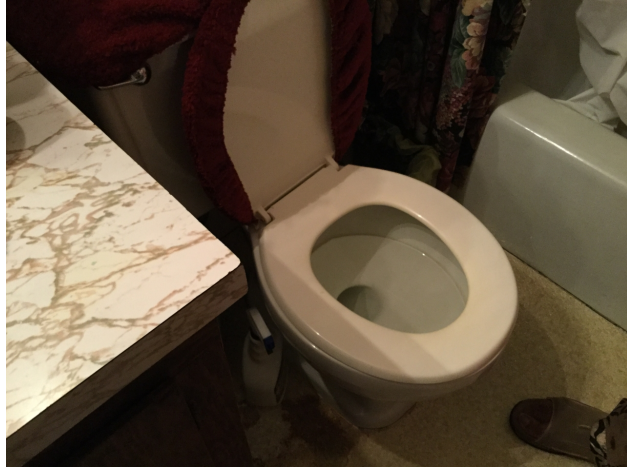
8/8/2018 12:35:46 PM