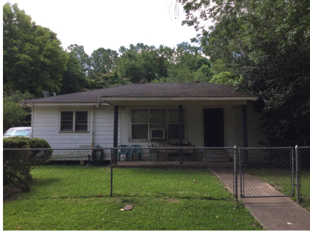
5/31/2018 2:57:22 PM