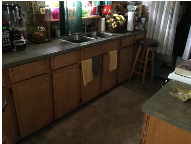
8/7/2018 1:19:01 PM