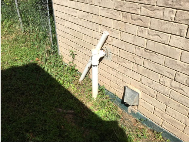
8/8/2018 12:36:08 PM

Project Number: CD-13256 Address: 419 GREENFIELD DRIVE Inspection Date: 8/8/2018