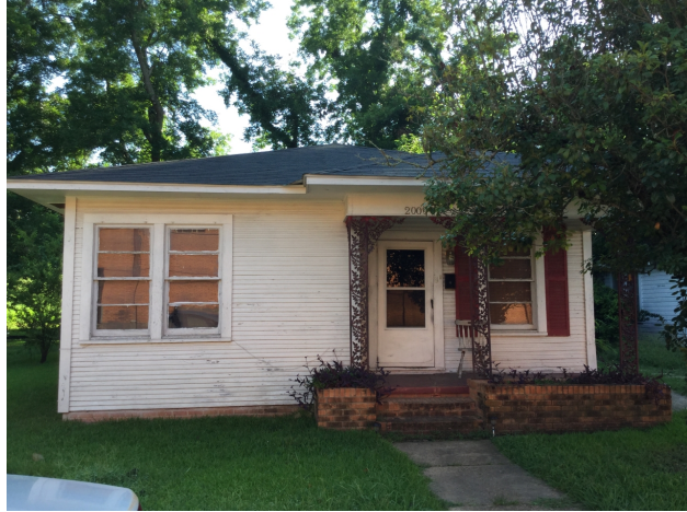
7/6/2018 12:34:08 PM