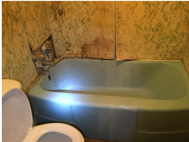
7/6/2018 12:34:25 PM