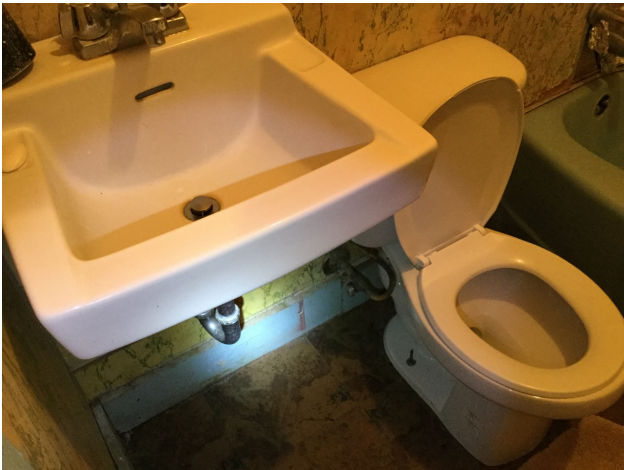
7/6/2018 12:34:25 PM