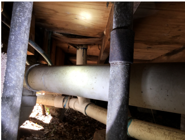
8/9/2018 9:33:54 AM