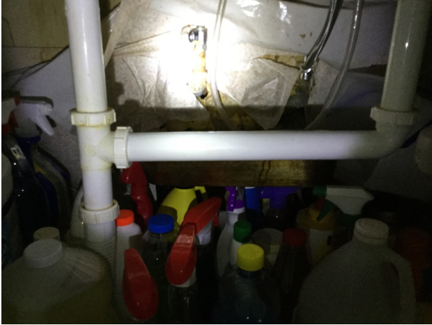
5/31/2018 2:58:04 PM

Project Number: CD-13163 Address: 4837 WILLOW GLEN STREET Inspection Date: 5/31/2018