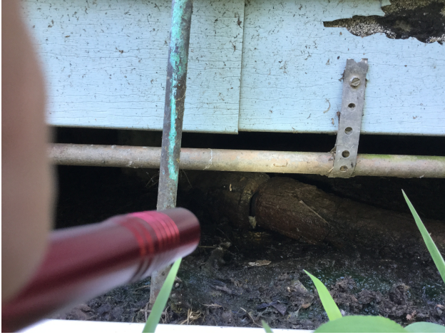
6/28/2017 3:22:47 PM

Project Number: CD-12954 Address: 4831 BETTY STREET Inspection Date: 6/28/2017