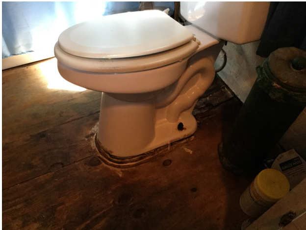
8/9/2018 9:33:41 AM

Project Number: CD-13233 Address: 326 13TH STREET Inspection Date: 8/9/2018