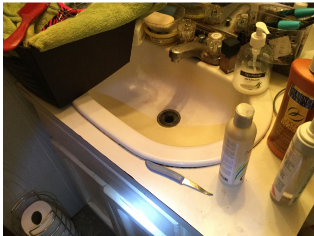
8/7/2018 1:19:13 PM