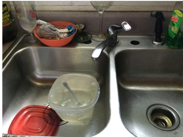
8/9/2018 9:33:38 AM