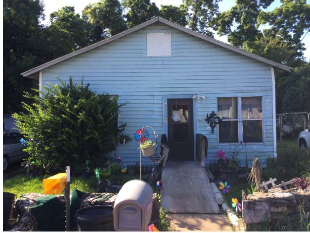
6/28/2017 3:14:38 PM