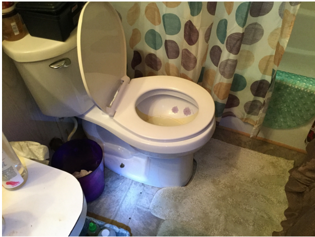
8/7/2018 1:19:12 PM

Project Number: CD-13241 Address: 4108 MARGARET STREET Inspection Date: 8/7/2018