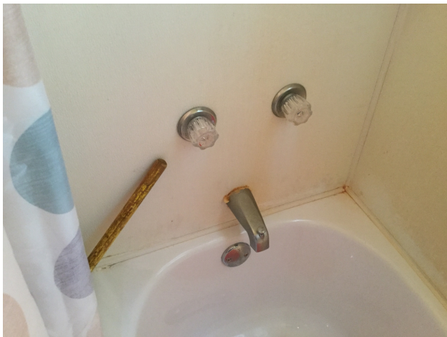
8/7/2018 1:19:16 PM