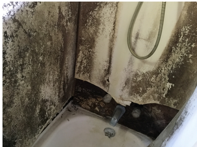
8/9/2018 9:33:43 AM