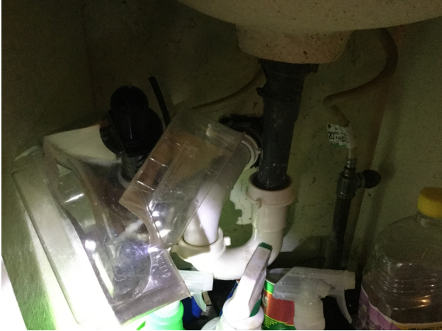
7/6/2018 12:34:15 PM

Project Number: CD-13183 Address: 2009 MAIN STREET Inspection Date: 7/6/2018