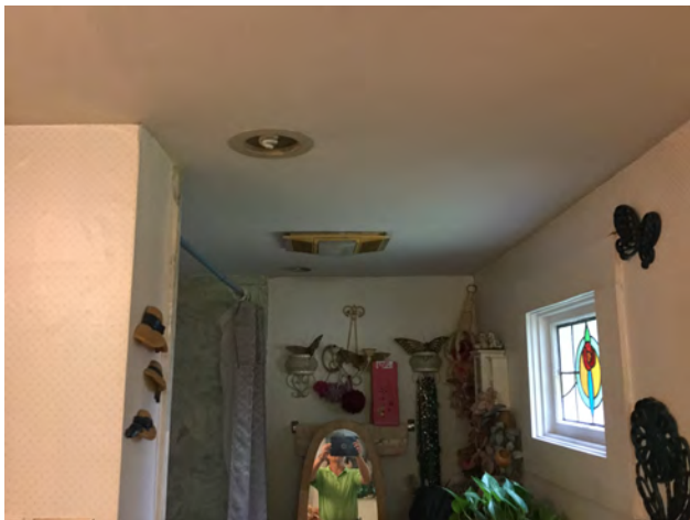
12/4/2017 3:42:57 PM