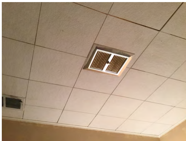
12/6/2017 11:30:38 AM 1st bathroom on left in hallway