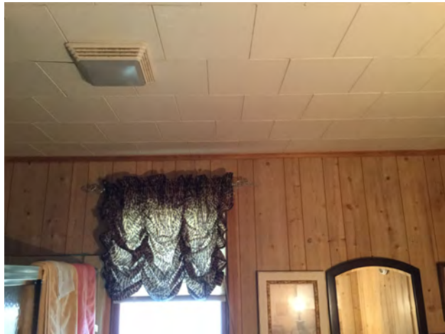
10/30/2017 12:33:27 PM