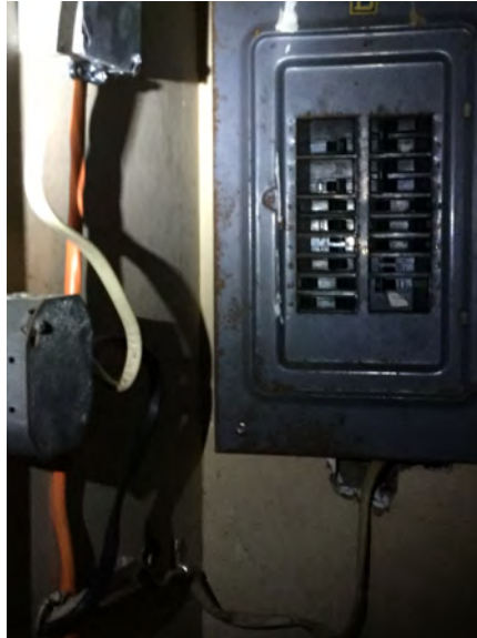
6/23/2017 8:53:58 AM