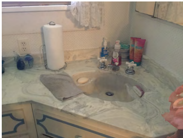
12/4/2017 3:42:54 PM