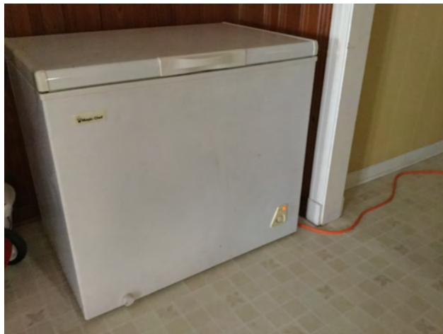
12/7/2017 3:37:28 PM