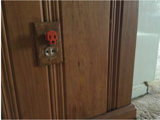
12/7/2017 3:37:27 PM

Project Number: CD-12947 Address: 2903 ELLBEE DRIVE Inspection Date: 6/23/2017