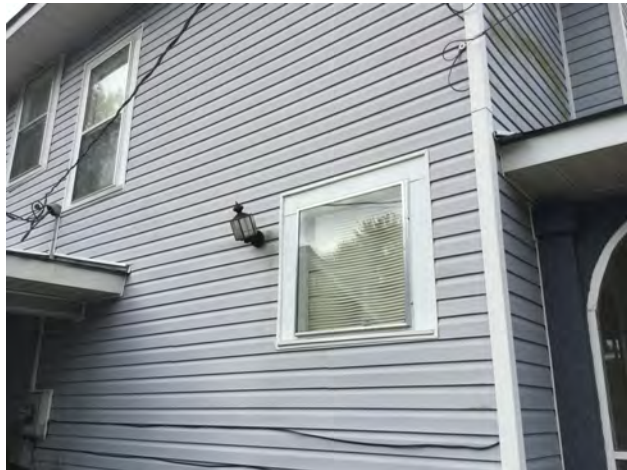
12/4/2017 3:42:04 PM