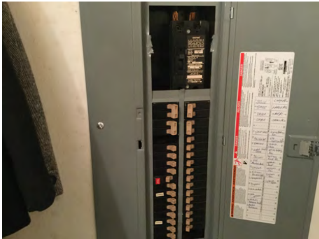
12/4/2017 3:42:42 PM

Project Number: CD-13047 Address: 2007 THORNTON COURT Inspection Date: 10/3/2017