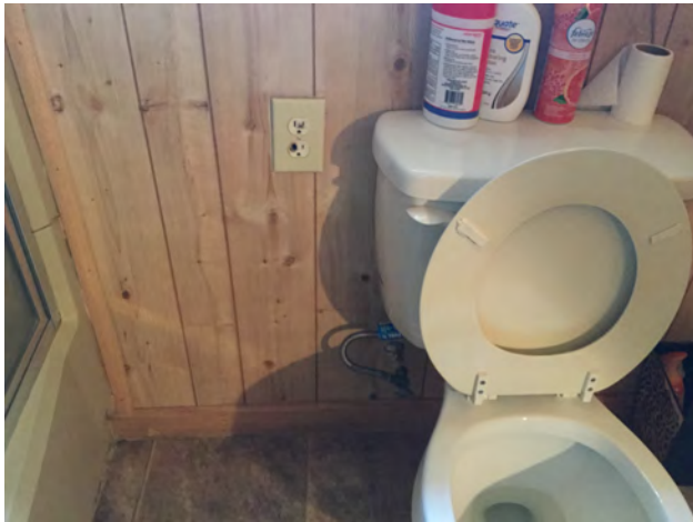
10/30/2017 12:33:32 PM

Project Number: CD-13048 Address: 526 HAROLD GLEN STREET Inspection Date: 10/3/2017