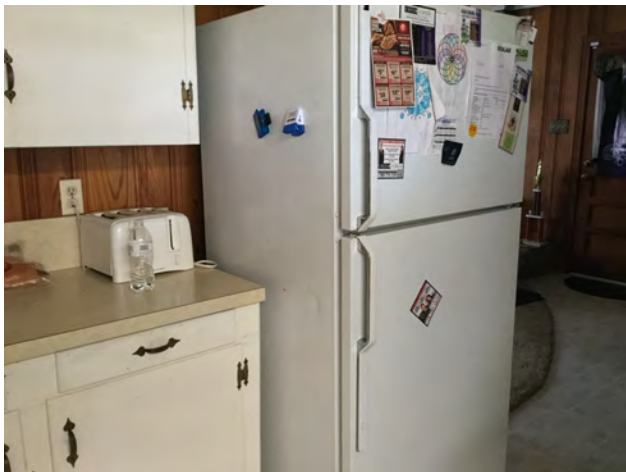
12/7/2017 3:37:36 PM