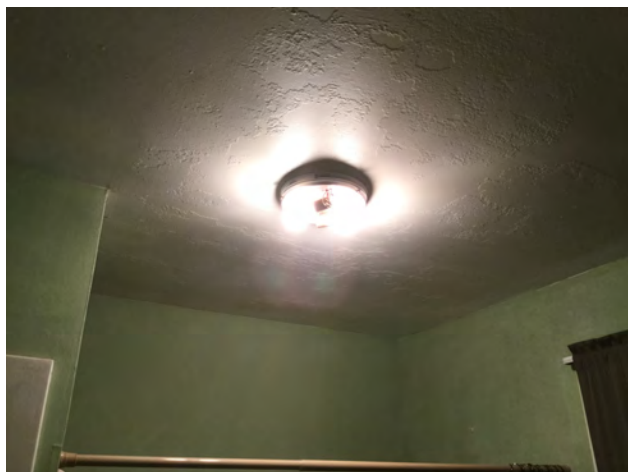
12/6/2017 11:30:35 AM Master bathroom

Project Number: CD-12919 Address: 2244 THORNTON COURT Inspection Date: 6/23/2017