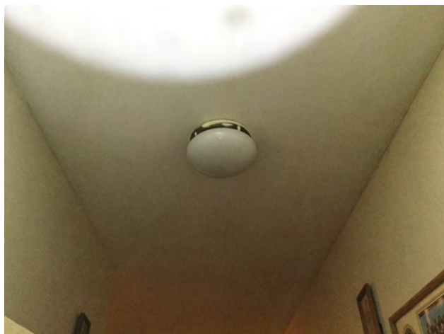
12/6/2017 11:30:53 AM Hallway