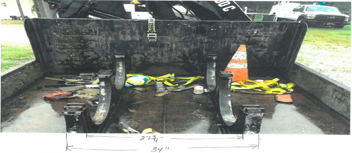
Cylinder Cradle Measurements ( approximate)