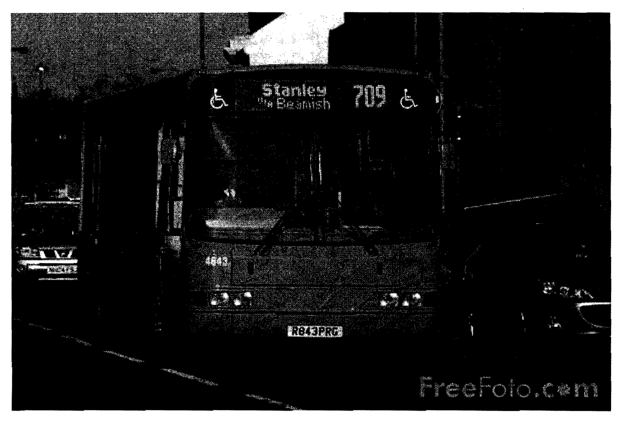
Title VI Program

As required by the Federal Transit Administration 2018